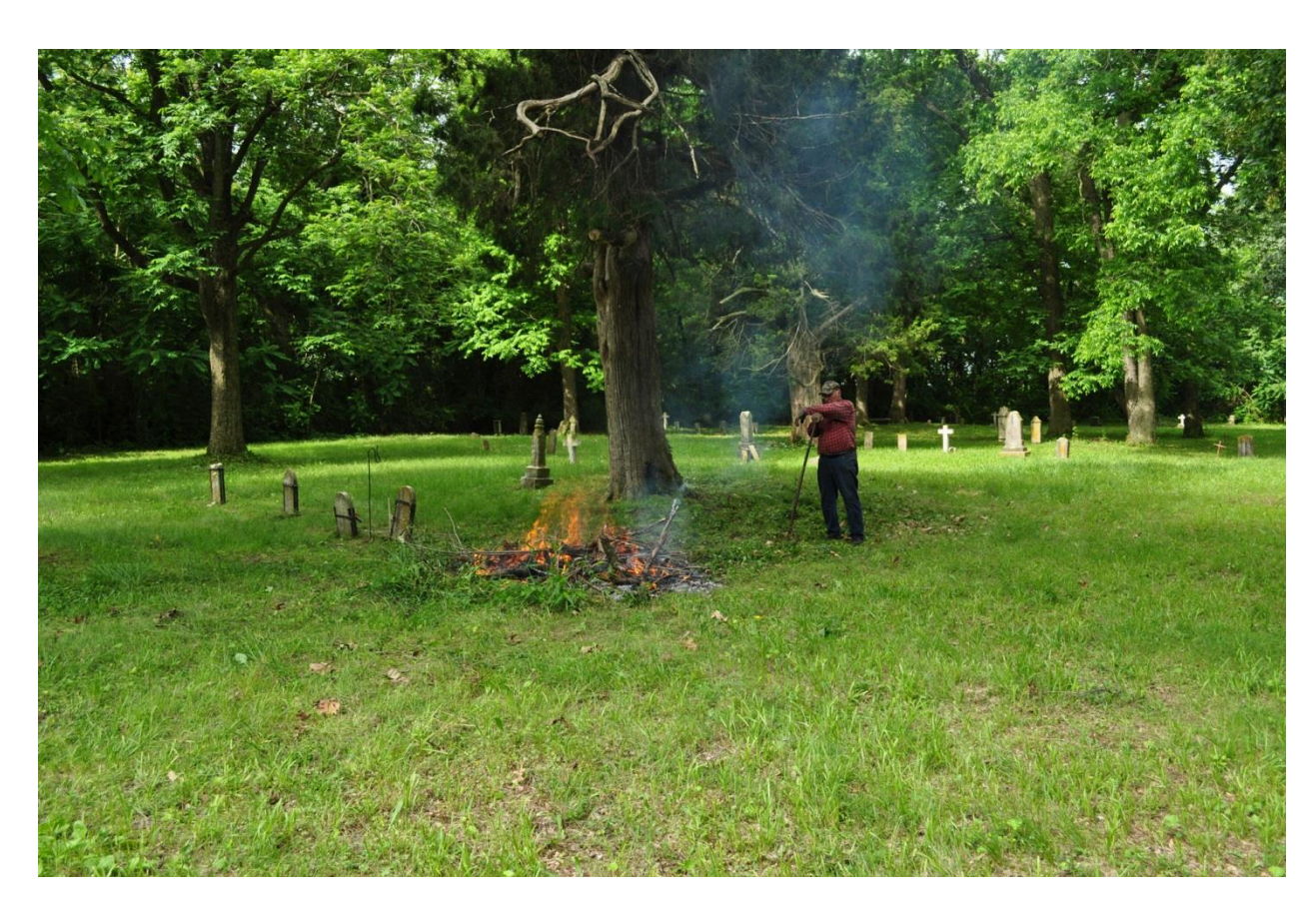
Clean up at the Newtonia Civil War Cemetery—what our CWRT donation helped pay for!!