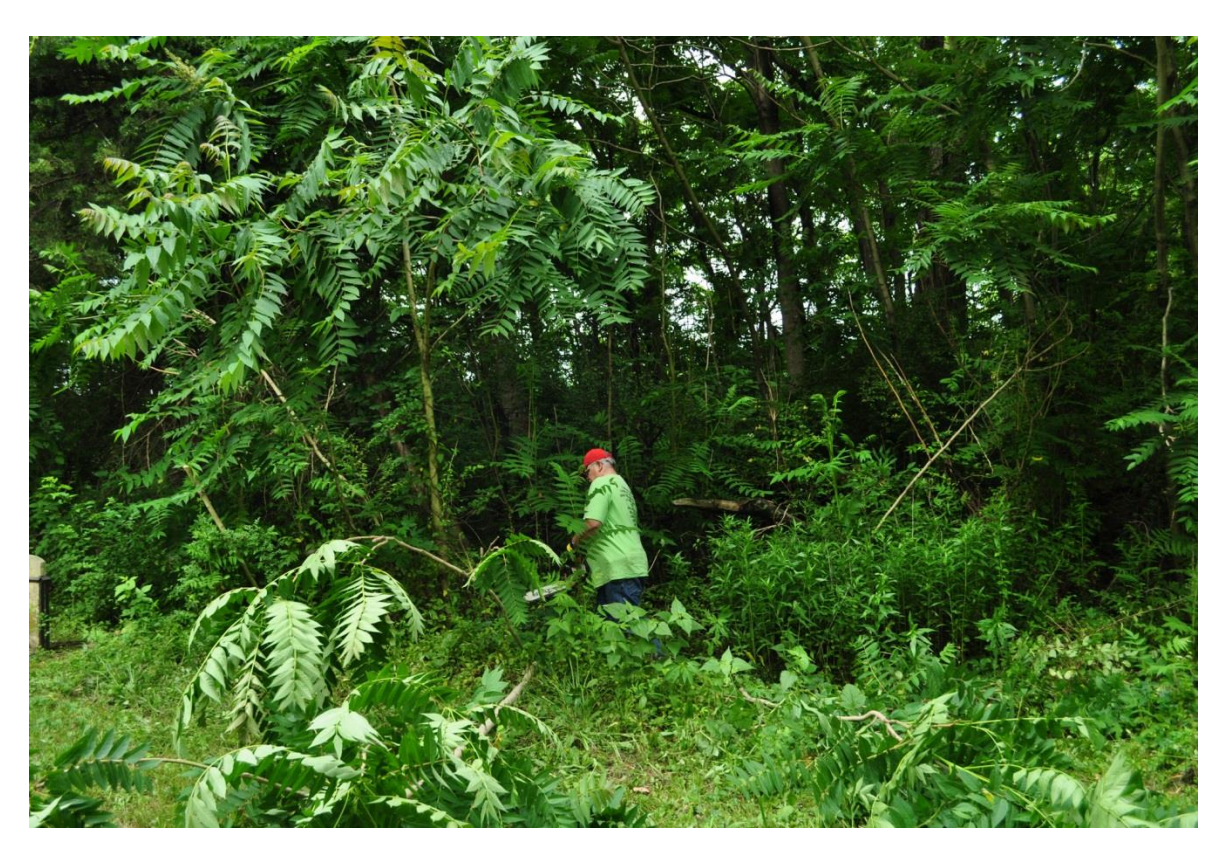
Clean up at the Newtonia Civil War Cemetery—what our CWRT donation helped pay for!!